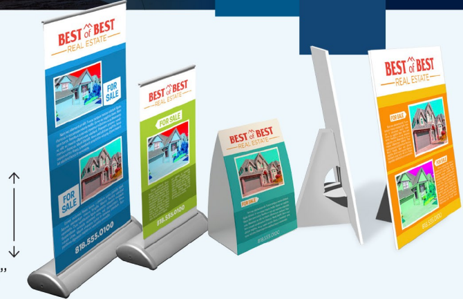
↑ ↓ 12", 17" & 32"

Coming in a variety of sizes and shapes, these eye-catching displays are a great way to deliver messaging or to boost awareness to your listings, policies, or promotions.